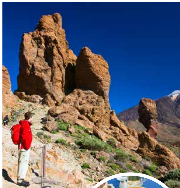
Garachico, top, is a great base for hikers heading into the interior, above; papas arrugadas with red and green mojo sauces, right

Rising out of the sparkling ocean is majestic Mount Teide, at 12,198ft the world's third-largest volcano and the highest peak in Spain. A hike up takes six hours and plenty of stamina, while the cable car whisks you up in eight minutes. Take warm clothing – it may be hot on the beach but the peak is snow-capped for half the year. Special guided night visits take in